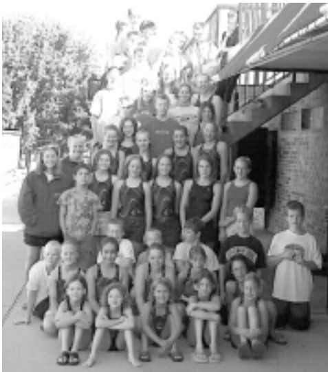
2003 Cherokee Swim Team